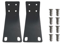
Wall Mounting Accessory